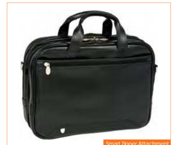
Smart Zipper Attachment