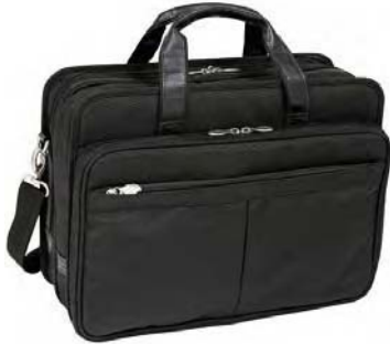
WALTON | 73985