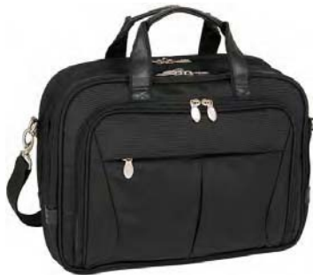
PEARSON | 74565