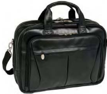
PEARSON | 84565