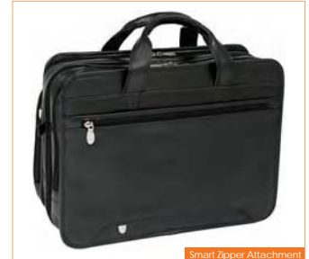
Smart Zipper Attachment