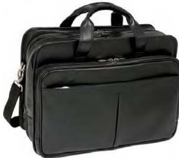
WALTON | 83985